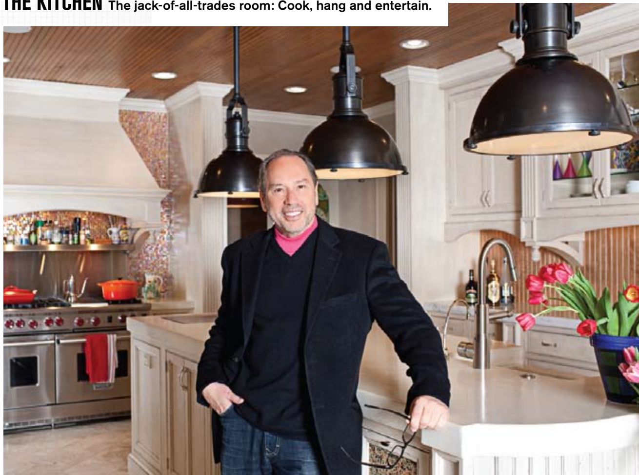
SOURCE-ERER Finds like the textured glass in the drawers, a customized hood and 1920s industrial lights found from an old warehouse are Weinberg's specialty.